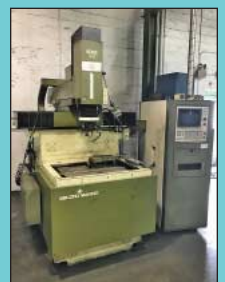
Makino Model EDNC-64 Four-Axis CNC Sinker EDM