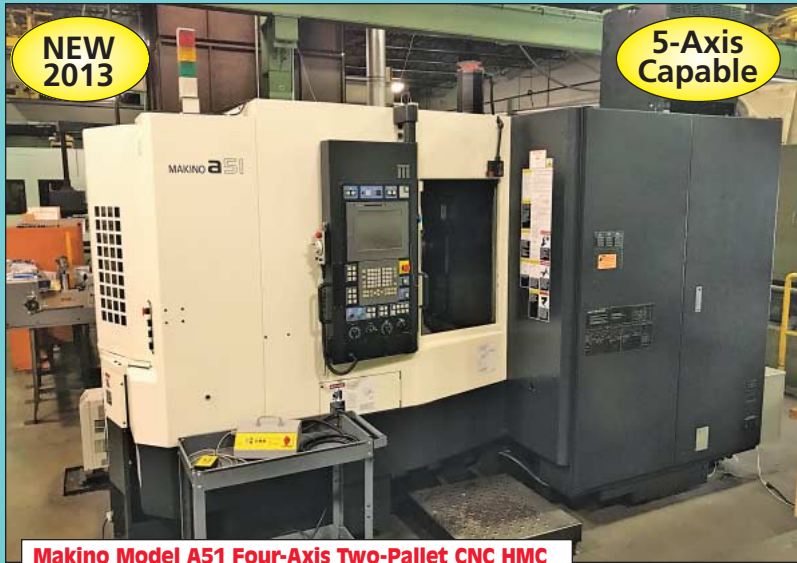
Makino Model A51 Four-Axis Two-Pallet CNC HMC

SALE DATE: THURSDAY, SEPTEMBER 6TH, STARTING AT 9:00 AM INSPECTION: WEDNESDAY, SEPTEMBER 5TH FROM 10:00 AM TO 4:00 PM