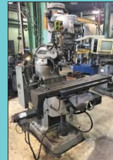
2 HP Bridgeport Model EZ-Trak Dx CNC Vertical Mill