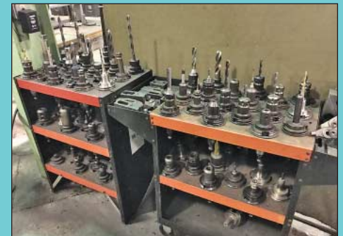
(350) No. 50 and (250) No. 40 Tool Holders