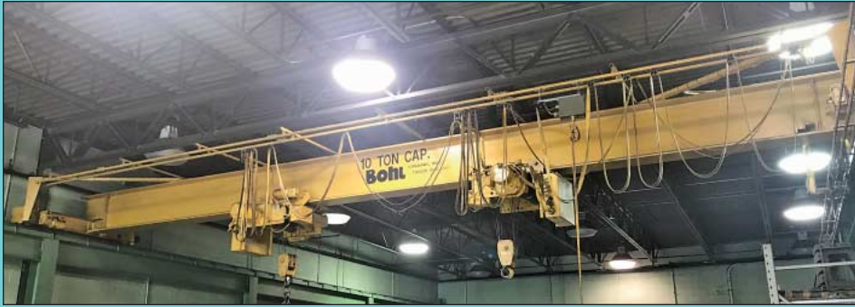
10 Ton x 40' (Approx.) Span Bohl Single Girder Top Running Overhead Bridge Crane