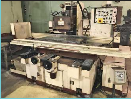
16" x 40" Chevalier Model FSG-1640AD Hydraulic Surface Grinder