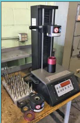
(2) Heat Shrink Units, (1) 50 and (1) 40 Taper