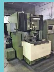
Makino Model U53 CNC Wire EDM