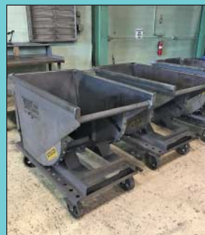
(4) Portable Self Dumping Hoppers