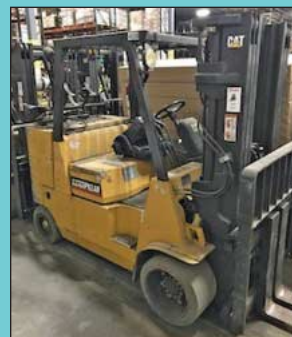
(2) 11,000 Lb. Caterpillar Model GC55K LP Gas Solid Tire Lift Trucks