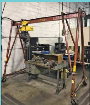
1 Ton x 9' Leg Span Wallace Adjustable Height Portable A-Frame Crane