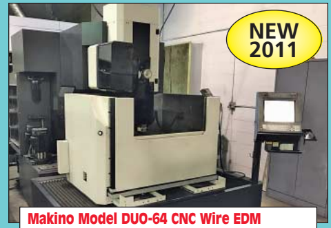
Makino Model DUO-64 CNC Wire EDM