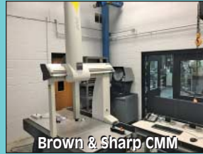
Brown & Sharp CMM