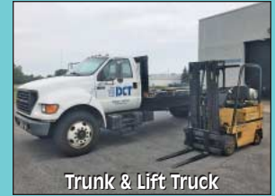
Trunk & Lift Truck