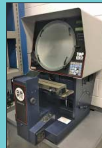
14" OPG Optical Comparator