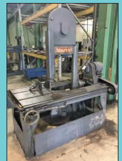
18" x 20" Marvel No. 8 Tilt Frame Vertical Metal Cutting Band Saw