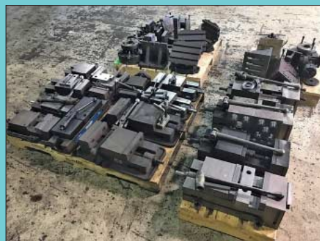
(20) Various Style 6" Vises By Kurt and Others, (4) 8" Kurt PT800 Vises