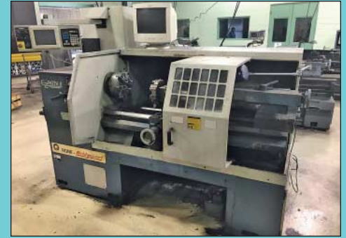
18" x 42" Romi-Bridgeport Model EZ-Path II Two Axis CNC Turning Center