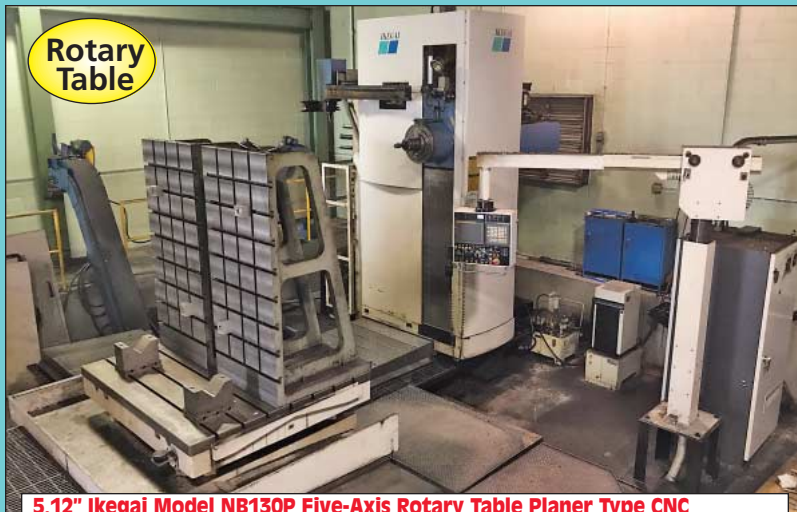
5.12' Ikegai Model NB130P Five-Axis Rotary Table Planer Type CNC Horizontal Boring and Milling Machine