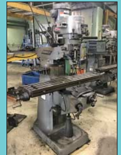
(3) 2 HP Bridgeport Dovetail Ram Variable Speed Vertical Milling Machines