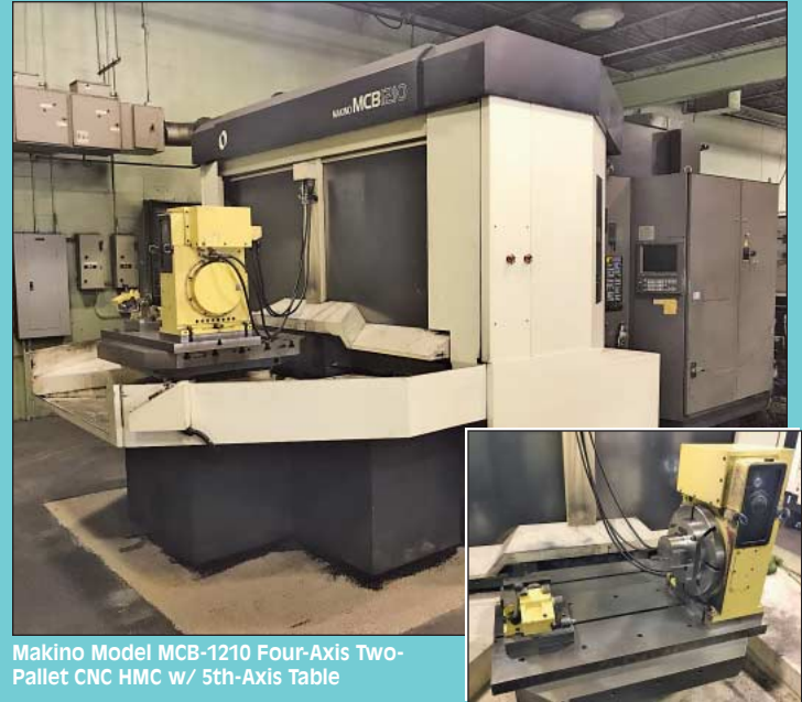
Makino Model MCB-1210 Four-Axis Two-Pallet CNC HMC w/ 5th-Axis Table

Kitamura Model Mycenter 3x Three-Axis CNC VMC; s/n 11403, Variable Spindle Speeds to 8,500 RPM, 14" x 35" T-Slotted Table, 40 Taper Spindle, 30" X-Axis, 18" Y-Axis, 18" Z-Axis, 20 Pos. ATC, Fanuc OM Control Daewoo Model DMV-500 CNC VMC; S/N AV5S0699, 20" X 47.2" Table, 40" X-Axis, 20" Y-Axis, 20" Z-Axis, 10,000 RPM, 30-Position ATC, 40 Taper, Fanuc 18M Control (New 2000) -- To be Sold Via Photo, Located Offsite