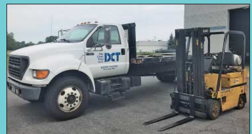
2000 Ford F650 20' Flat Bed Truck and 5,000 Lb. Caterpillar Lift Truck