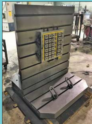
(2) 39" x 46" Cast Iron T-Slotted Angle Plates