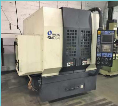
Makino Model SNC-64GS Three-Axis CNC Graphite VMC