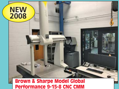
Brown & Sharpe Model Global Performance 9-15-8 CNC CMM