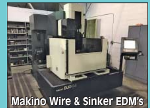
Makino Wire & Sinker EDM's