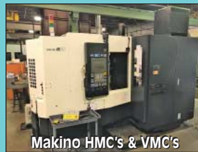
Makino HMC's & VMC's

Contact Information 2020 Dunlap St. Cincinnati, Ohio 45214 Phone 513-241-9701 Fax 513-241-6760 www.cia-auction.com