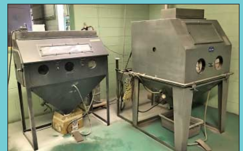
(2) Blast Cabinets with Reclaim