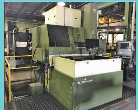
Makino Model 85W Four-Axis CNC Sinker EDM