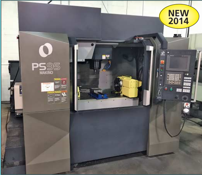
Makino Model PS-95 Four-Axis CNC VMC w/ 10" Nikken 4th Axis Table