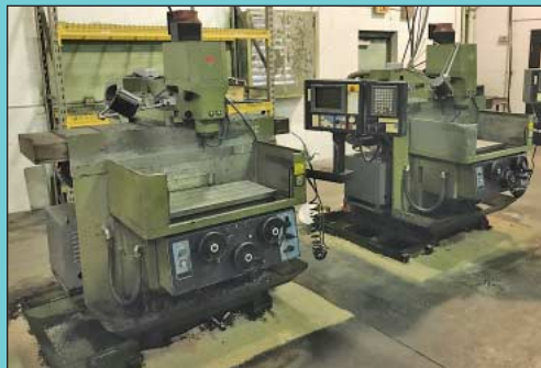
(2) Makino Model KE-55 Three-Axis CNC Vertical Mills