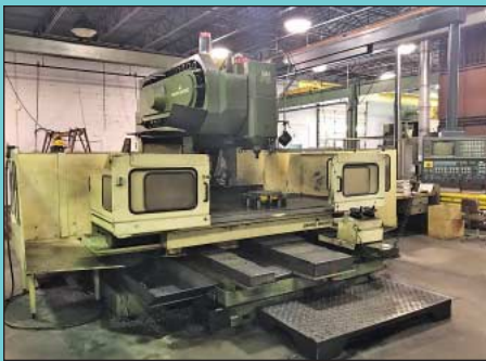
Makino Model GN1712-A40 Three-Axis Die Mold CNC VMC