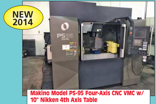
Makino Model PS-95 Four-Axis CNC VMC w/ 10' Nikken 4th Axis Table