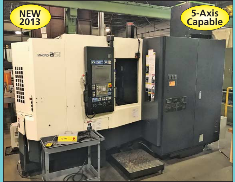
Makino Model A51 Four-Axis Two-Pallet CNC HMC