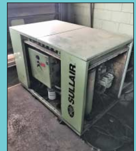
30 HP Sullair Model LS-10-30HACAC Air Compressor