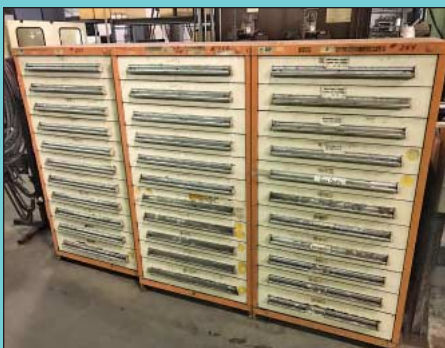
(6) Vidmar Cabinets Loaded w/ Perishable Tooling and Carbide