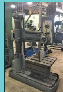
3' x 9" Column Beronzi Model FS1000 Radial Arm Drill