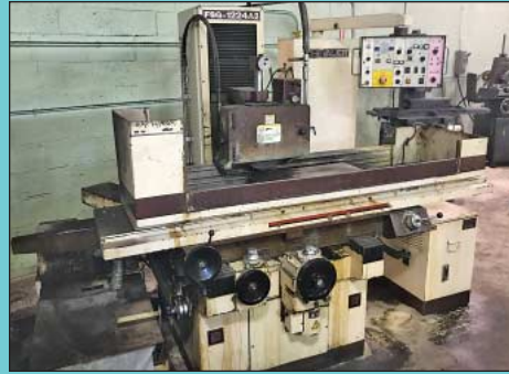
12" x 24" Chevalier Model FSG-1224AD Hydraulic Surface Grinder