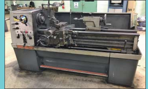
15" x 50" Clausing Colchester Geared Head Toolroom Engine Lathe

2,000 Lb. Big Joe Model 2024-a5 Electric Hydraulic Walk Behind Die Lift