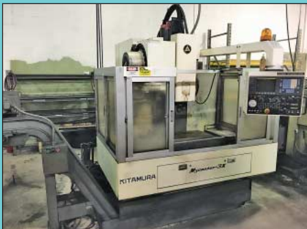
Kitamura Model Mycenter 3x Three-Axis CNC VMC