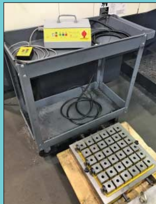
(4) 17" x 17" Earthchain Model EEPM-4040 Electro Magnetic Chucks